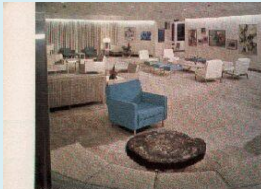
The luxurious Lounge can double as a movie theater.

The ship's nuclear reactor created steam that drove the engines turbines. The ship could travel 330,000 miles without refueling. That is 14 times around the world.