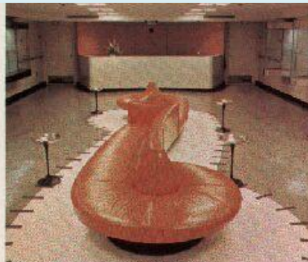
The Mess facility, looking toward the Prison's Square.