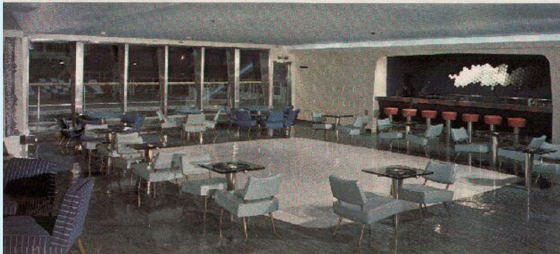
The spacious Veranda views onto the Salvo's Big Pool.