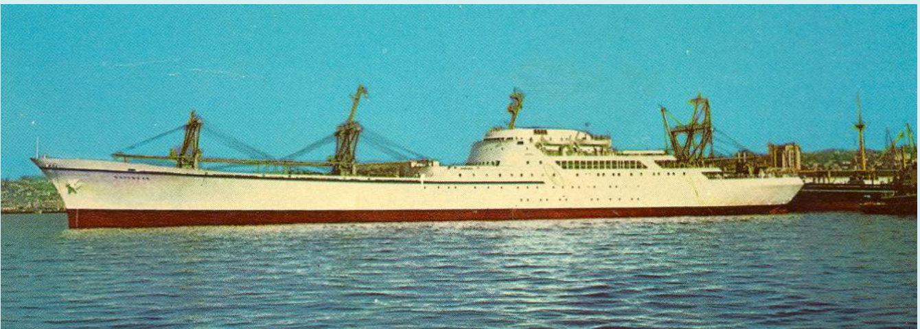
The NS Savannah in San Diego in 1962. For safety concerns, the Port required the ship to be backed into the pier so, if an emergency occurred, the ship could be moved out of the port quickly.

The NS Savannah is a sleek white ship looking like a large yacht. It was taken out of service in 1971 by the Nixon administration when they decided not to fund the operation. It was a museum in Charleston, South Carolina for a few years and now is laid up at a pier in Baltimore. Some tours are conducted. The NS Savannah Association ( N/S SAVANNAH ASSOCIATION Home Page ) has done some restoration and is looking for funding for a full restoration and setting up a museum. The website has an excellent virtual tour of the ship. There are also some good videos on YouTube by searching on NS Savannah .